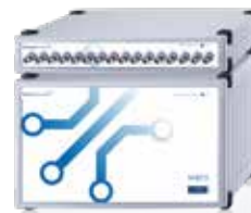
Nanonis Tramea multifunctional, low noise, low drift and high resolution electronics.