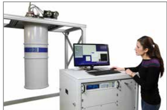
The latest Triton dilution refrigerator with increased experimental space and cooling power.

This publication is the copyright of Oxford Instruments Nanotechnology Tools Limited and provides outline information only which (unless agreed by the company in writing) may not be used, applied or reproduced for any purpose or form part of any order or contract or be regarded as a representation relating to the products or services concerned. Oxford Instruments' policy is one of continued improvement. The company reserves the right to alter, without notice, the specification, design or conditions of supply of any product or service. Oxford Instruments acknowledges all trade marks and registrations. © Oxford Instruments Nanotechnology Tools Ltd, 2017. All rights reserved.