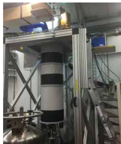
Figure 2. The experimental set-up used in this application note, showing the integrated Triton and Nanonis Tramea instruments.

In our experiment, we study thermodynamics and spin-orbit interactions on the level of single electrons and in zero-dimensional structures. To do this, we form single or double quantum dots (artificial atoms or molecules) in a semiconductor heterostructure. A wafer is grown to host a two-dimensional, highly conductive layer and then patterned with metallic finger-gates on top. We apply negative voltages in order to deplete the electron gas in the two-dimensional structure via Coulomb repulsion. In this way and with a suitable gate design shown in Figure 1, we are able to form zero-dimensional structures (quantum dots) to capture single electrons. The structures are then cooled to an electron temperature of 40 mK in a dilution refrigerator.